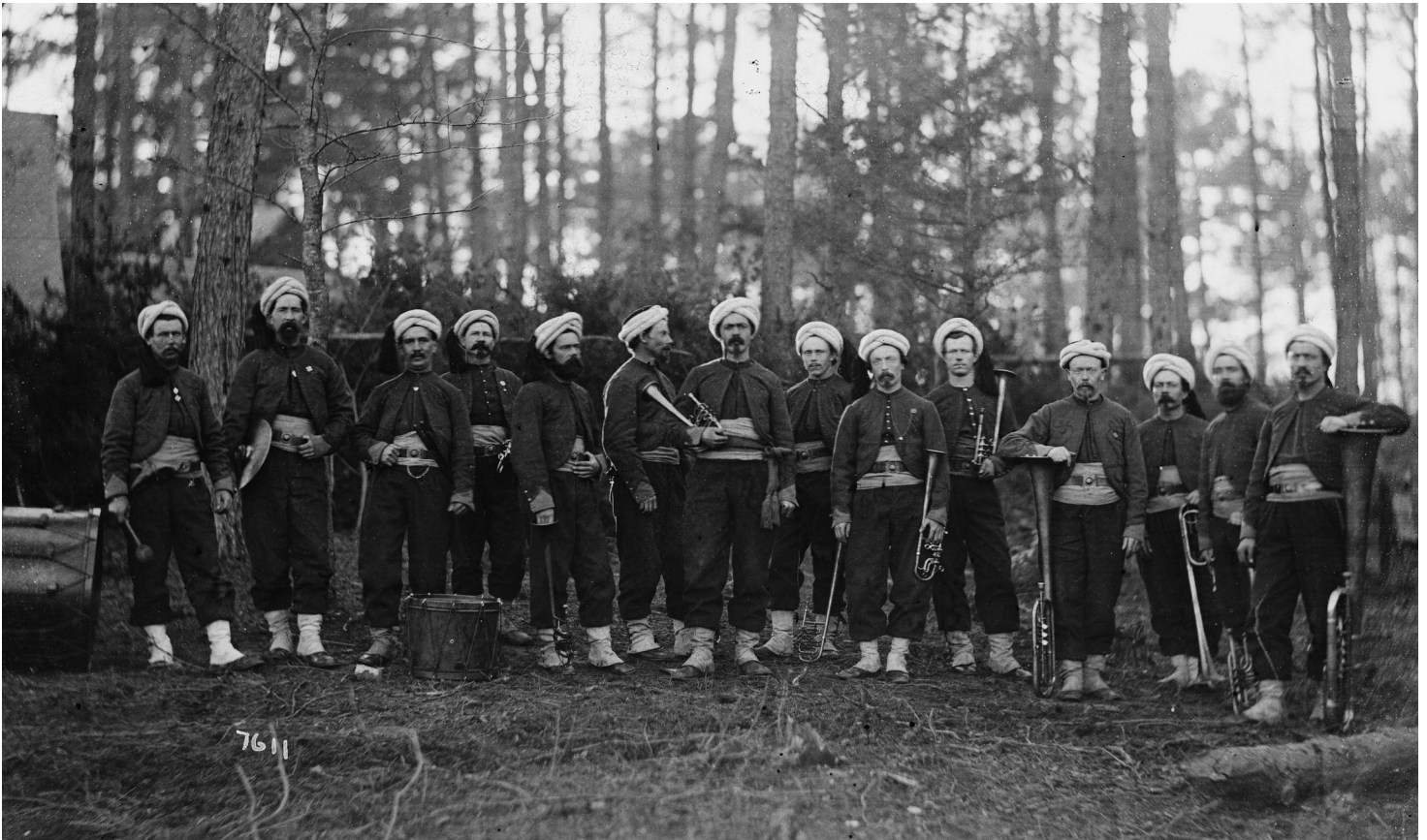
"Brandy Station, Va. Band of the 114th Pennsylvania Infantry (Zouaves)" Detail of photograph. (1864)